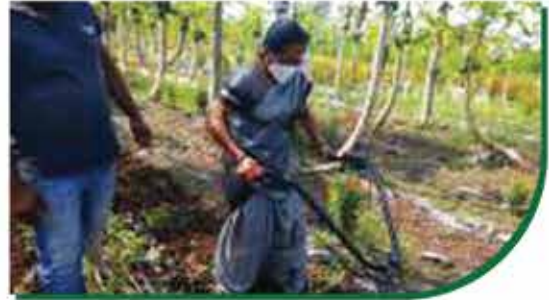
On-Field Demonstrations and Farmer Training