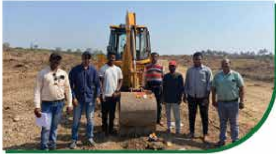
Vsanat Dada Sugar Institute