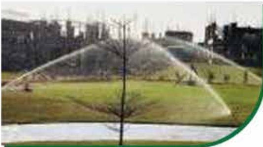
Expert Technical System Installations