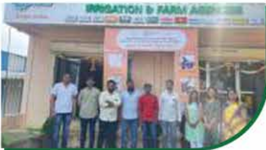
Dedicated and Hardworking Team