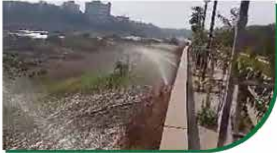
PMC River Beautification Project