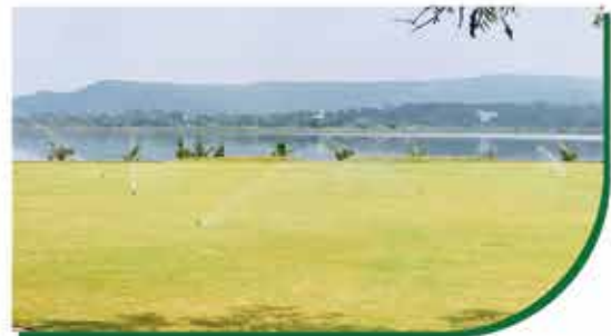
Collaborating with Government Departments