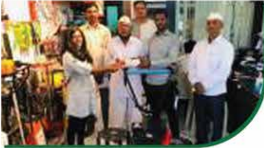
Delivering Happiness Through Technology