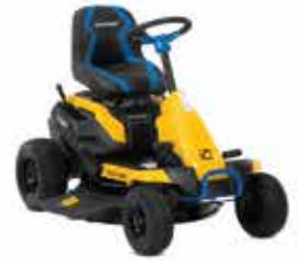
Ride On Mowers