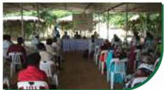
Participation in Exhibitions