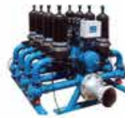
Automation and Filtration Systems