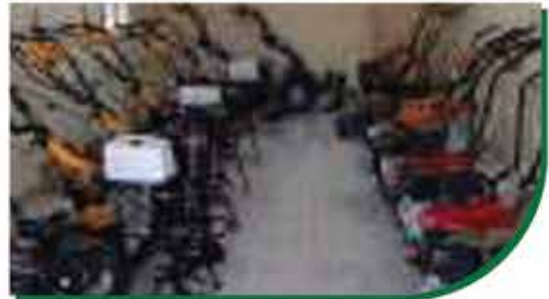
Comprehensive Showroom Experience