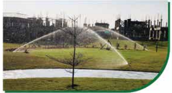
Variavara Project Pharade Builder