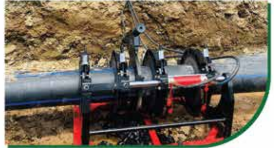
PMC River Beautification Project